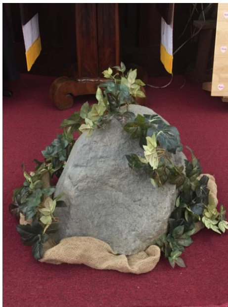
Moses' resting place Deuteronomy 34:1-12