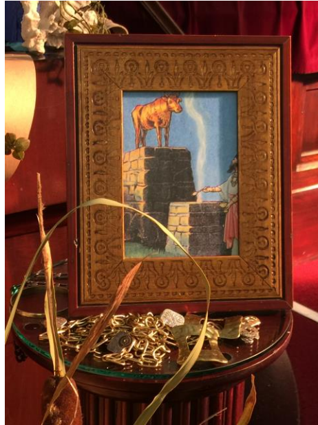
Golden calf Exodus 32:1-26