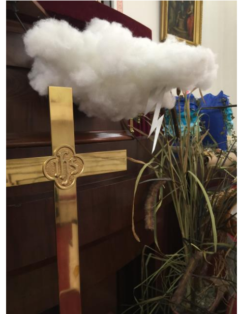
God's presence Exodus 33:12-23