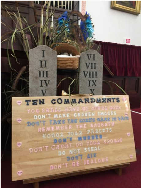
The Ten Commandments Exodus 20:1-4,7-9,12-20

You can see all the displays she made on our website: EllsworthUCC.org